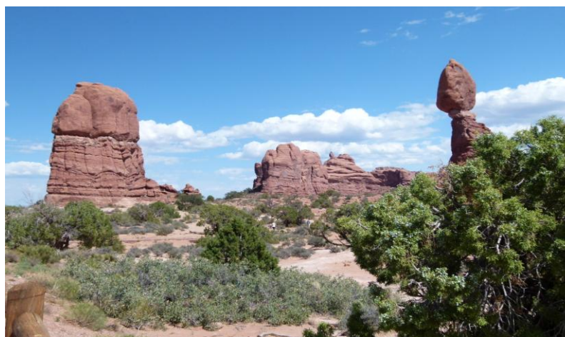
Balanced Rock by RenoSoHill

Please vote on next year's location Saturday night at the Party. We hate to play spin the bottle.